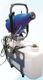
Tornado & Tornado/Flex