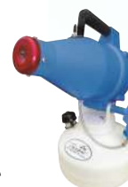
Cyclone STD & Ultra